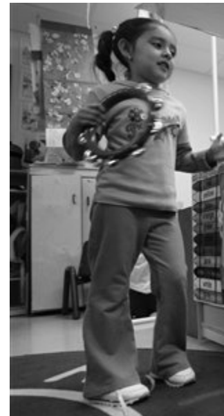
Music and Motion gives preschoolers the opportunity to explore singing, creative movement, and rhythm instruments

For more details about these activities or other happenings for youth or adults at Elizabethtown Public Library, call 367-7467, visit our website at www.ETownPublicLibrary.org , or drop by the Library at 10 South Market St., Elizabethtown.